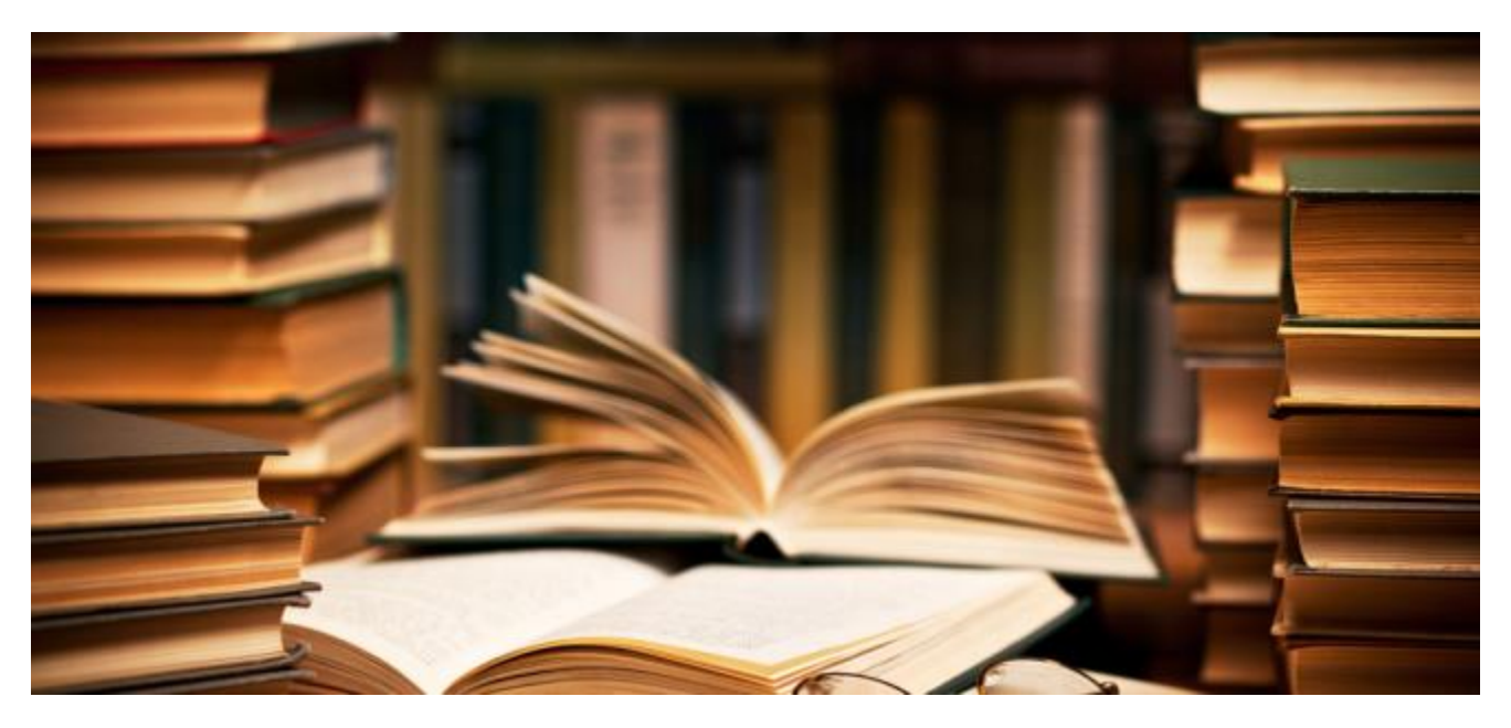
November 29, 2018 ~ ginalaborde

Off-Campus Access to Library Resources now made by EZproxy